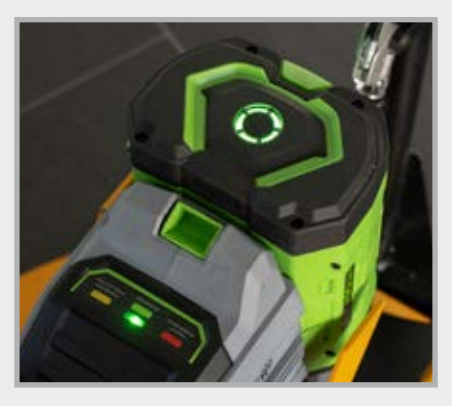
The powerful 56 V battery with 672 Wh provides sufficient power. The charge level is permanently displayed.