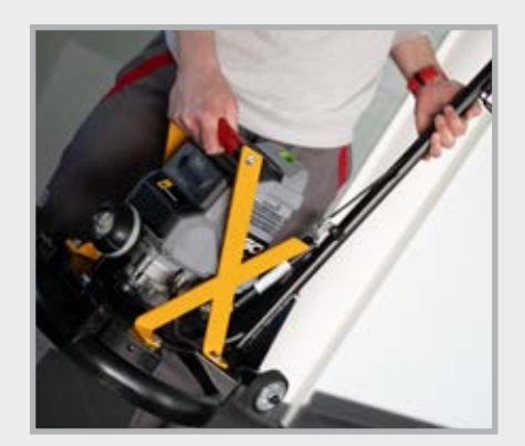
Thanks to transport wheels and a weight of only 21 kg, the machine can be easily transported by one person.