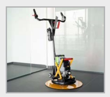
Perfect ergonomics thanks to infinitely adjustable tiller. Low-fatigue work due to operation of the switch with the whole hand.